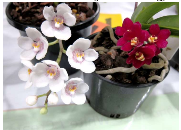
More seedlings-- plenty of potential here.