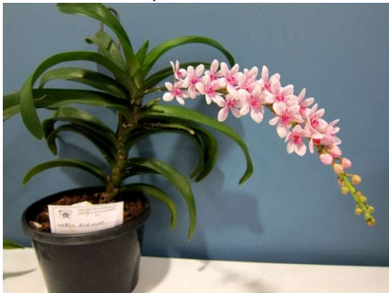
Sartylis Blue Knob