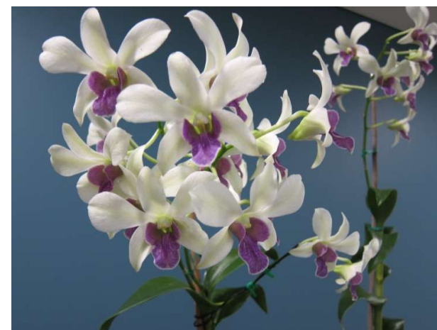
Hardcane Den. Woo Leng