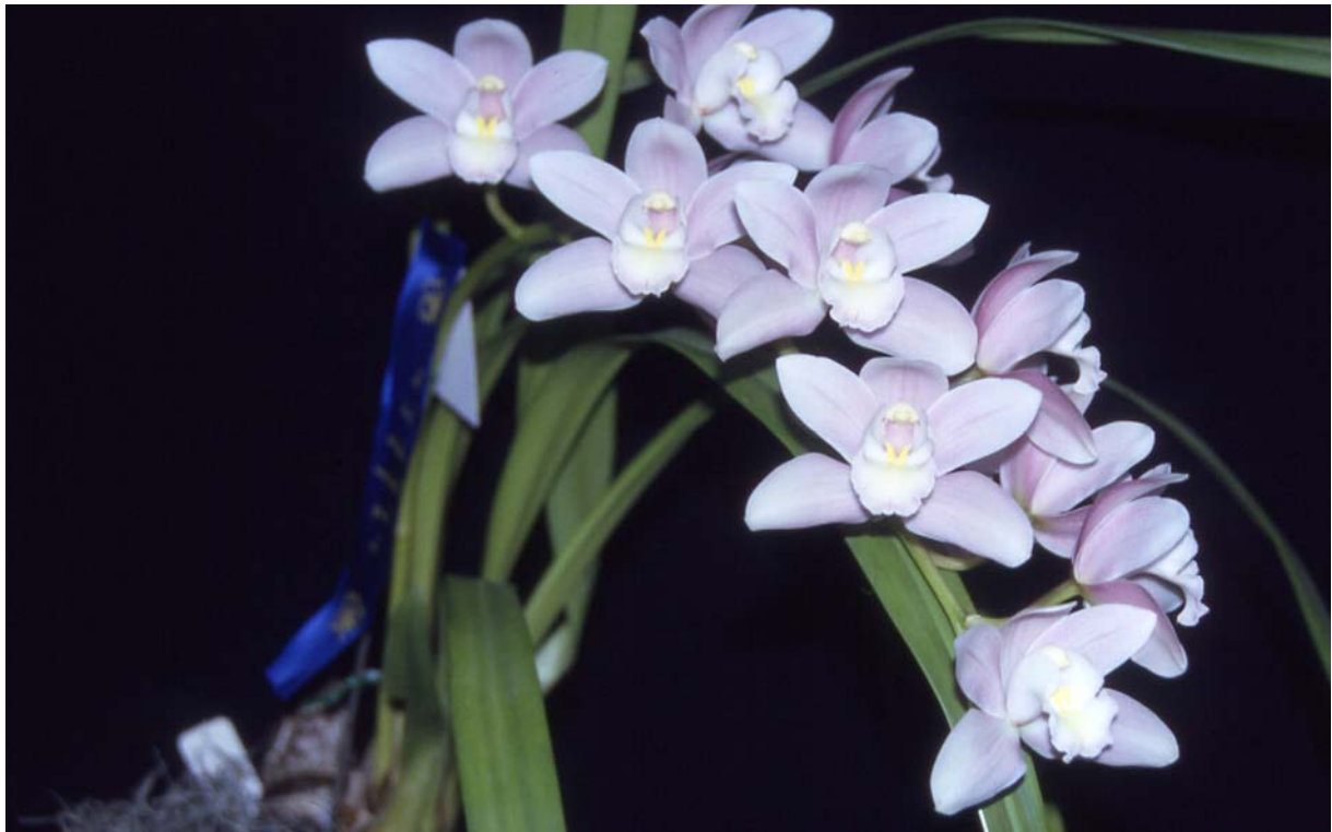
Cym. Without Peer 'Soft Touch' Autumn Show 2006

September 2007 meeting to be held on TUESDAY 18 th September, at the Adelaide West Uniting Church Hall 312 Sir Donald Bradman Drive Brooklyn Park..