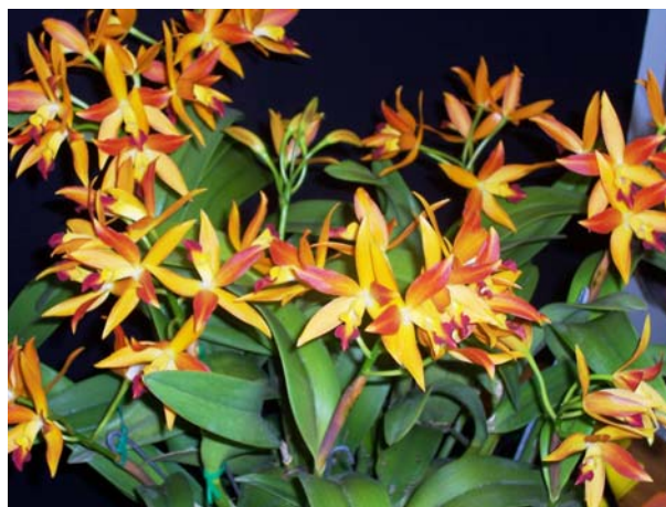
Gsl Adelaide Ablaze 'Fiery Gold'