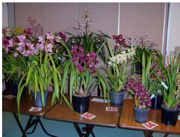
Cyms. on display