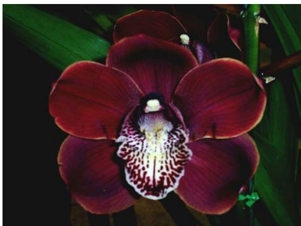
Cym. Blazing Fury.

Best large sized cym was Moss Bray's Cym Blazing Fury , a heavy textured solid mahogany red