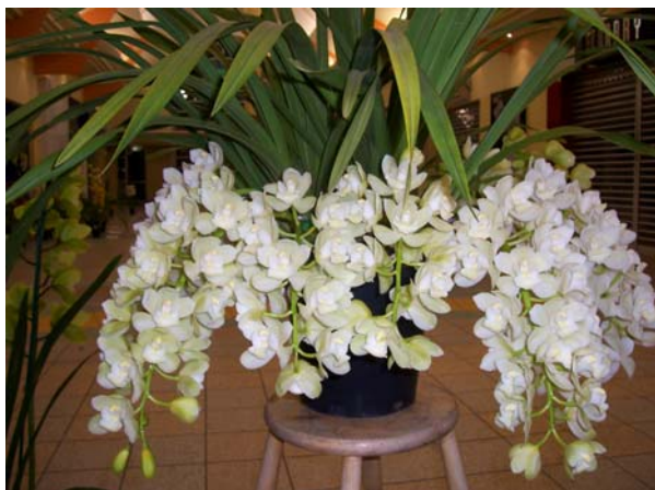
Cym Pure Sarah