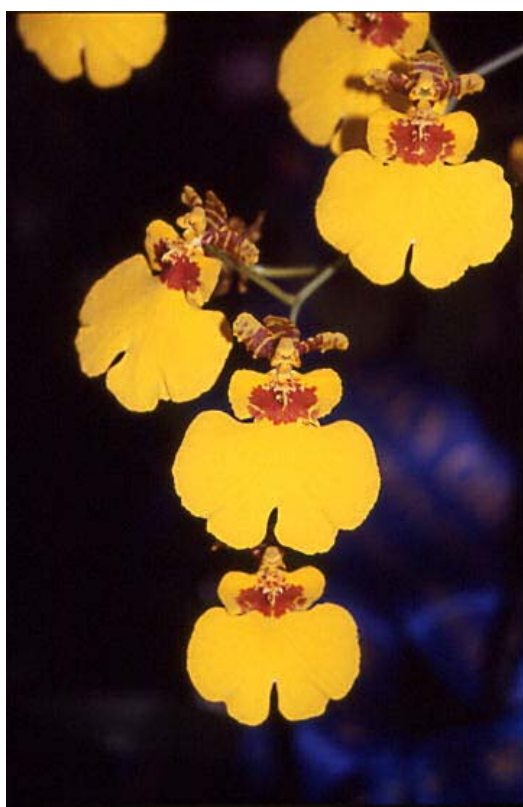
Onc. Sweet Sugar 2007 Winter Show Champion

July 2008 meeting to be held on the THIRD Wednesday of the Month, at the Adelaide West Uniting Church Hall 312 Sir Donald Bradman Drive Brooklyn Park..