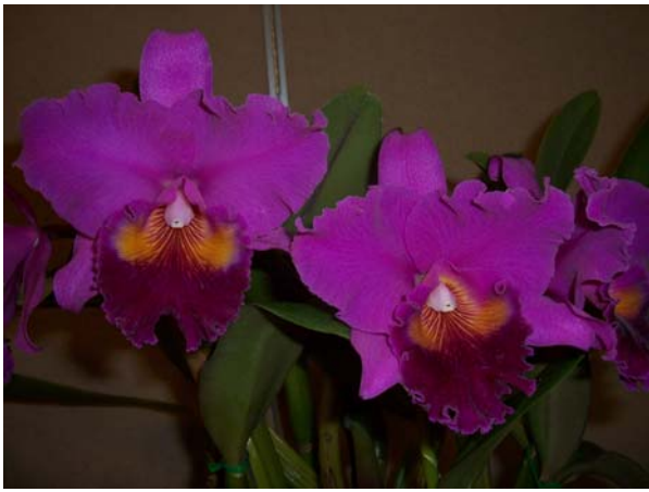
Sc Ovation 'Richard'