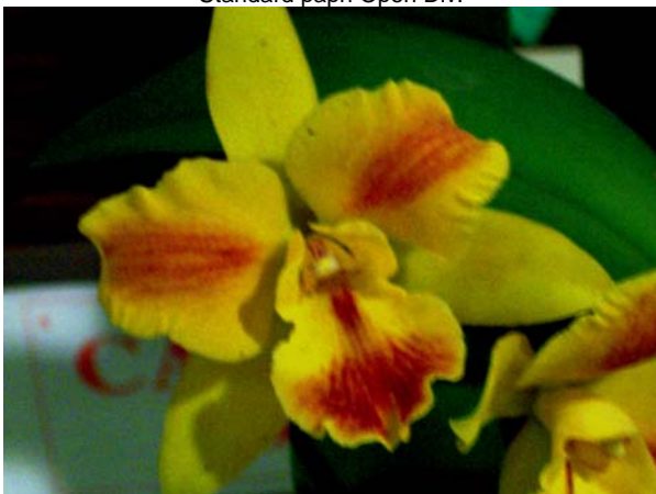
Pot. Burrana Beauty 'Burrana'