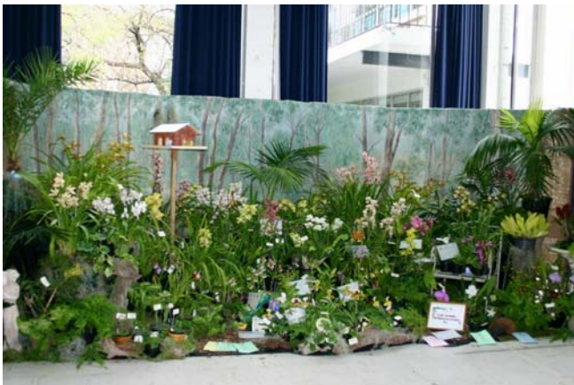
Our SAROC Display 2008