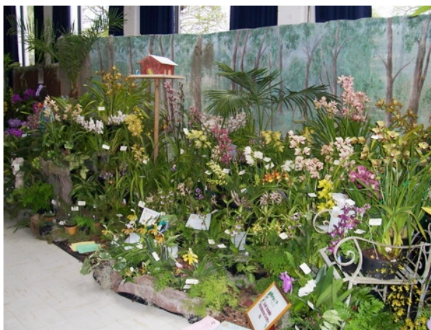
Our SAROC display.

Laelia anceps `Chamberlain's` shown by Les Burgess