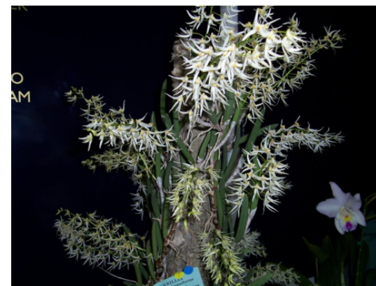
Champion Orchid SAROC 2008