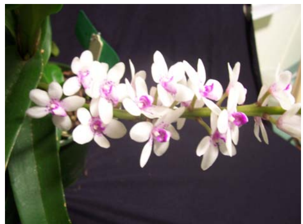
Sartylis Toowoomba Sparkle