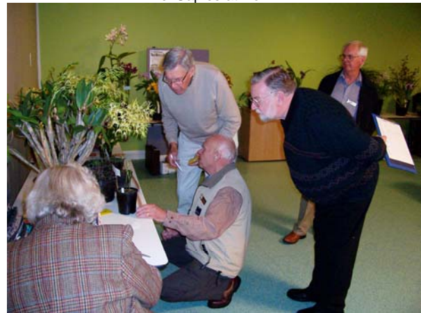
Judges at work scrutinised by Popular Vote supervisor.