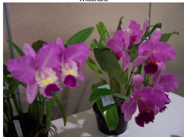
Showy standard cattleyas.