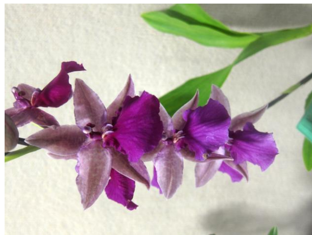
Oda Marguerite 'Voodoo . A very fine derivative from the old species Odont bictoniense .'