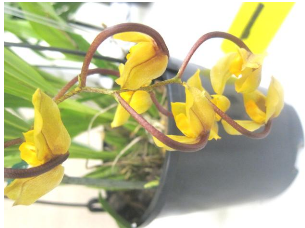
Another weirdo, Gongora galeata has many spikes hanging like bunches of grapes Easy to grow ,too.