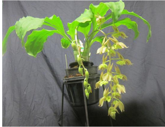
Fdk. After Dark x Ctsm fimbriatum