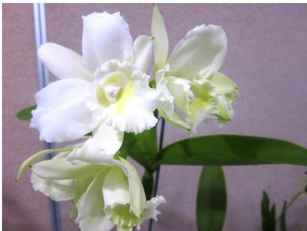
Diana Bird's pristine white Cattleya Photo Shoot was indeed photogenic last month.

showy, too, as Joe Cassar showed us last meeting.