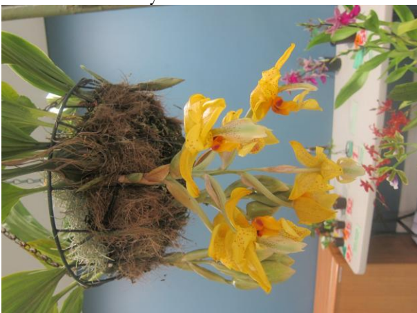
Note the pointy new spike poking through the basket. Many stanhopeas will grow in a shadehouse.

Again last month we saw some interesting plants. One of the most intriguing must have been Geoff Spears' species Stanhopea wardii , whose flowers grow straight down through the potting mix, making it essential to grow it in a basket which will allow the pointed flower spikes to poke through. .Hard to transport, but easy for Geoff to grow. He flowers it every year, but often it blooms between meetings and the flowers are only short-lived.