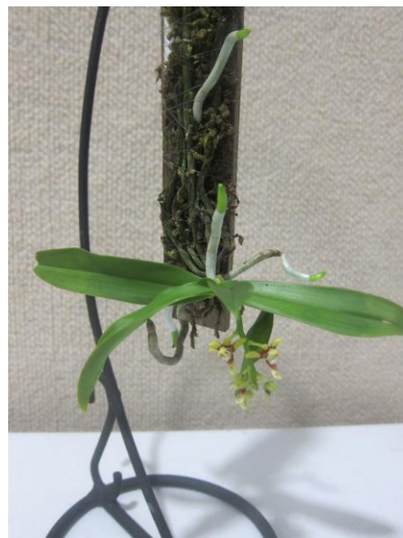
Sarcochilus hirticalcar last month.

My previous query on the effectiveness of foliar feeding resulted in some discussion I've found some comments from Dr Noel Grundon FAOC about the subject. Others have suggested that the waxy surface of some plants would prevent fertiliser from being absorbed through the leaf, necessitating spraying under the leaves so the stomata can allow fertiliser access. In addition, some orchids have thick, leathery leaves ( Den speciosum , Laeliinae , Vandas , Oncid . Etc) which are CAM group plants, whose stomata open only at night, therefore making it necessary for sprays to be used at night to be effective .if absorption via stomata is the only effective way. Dr. Grundon advises that that may not be the only way fertiliser is absorbed. His very interesting report is featured in last year's Orchids Australia September issue , which also features discussion on root vs. foliar uptake . There's a copy in our library, if you don't already subscribe.