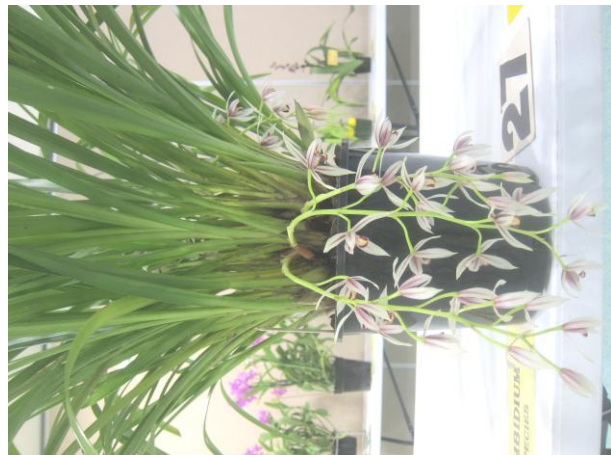
Cym dayanum , summer flowering cym.,. Nice plant, too.t

As you can see, the above four pictures are all side on – I can get more photos in this way. Sorry.