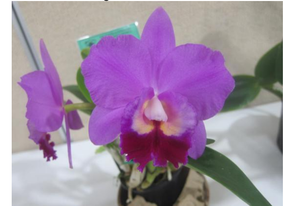
C Mini Surprise 'Merrigum'