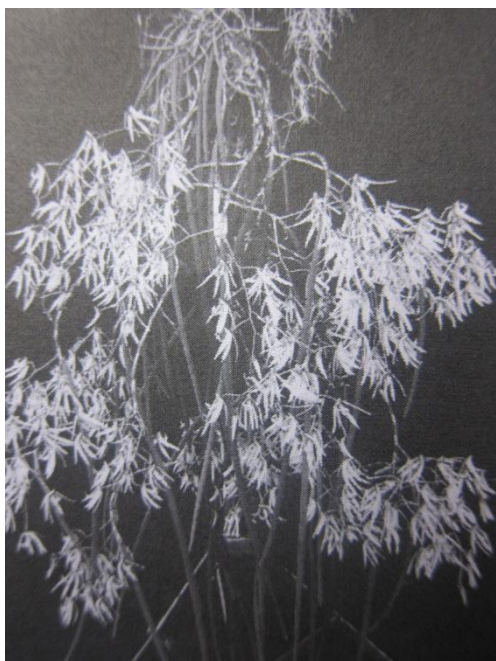
Grand Champion Den Wamberal