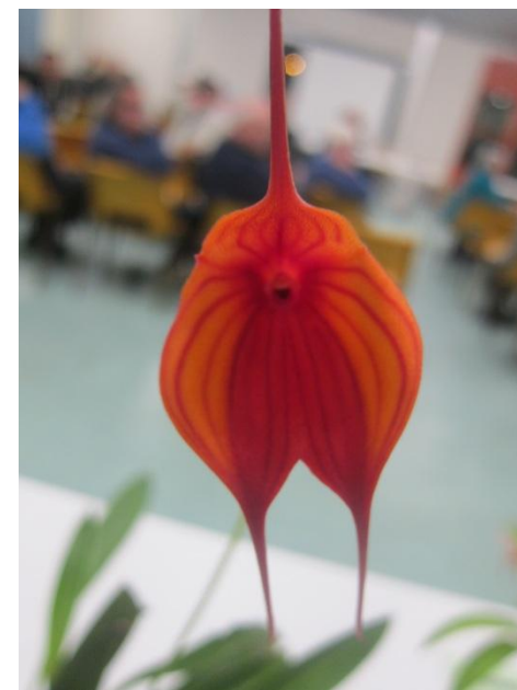
Masd . Cha Cha Cha `Foxy Lady` Better than many awarded clones.