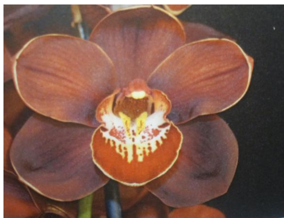
Seedling from Apache Flame 'Kahlua'