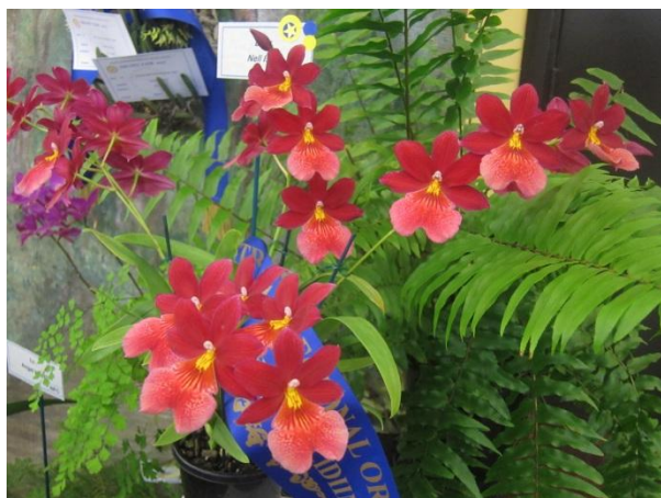
Eyecatching miltioniopsis in our display