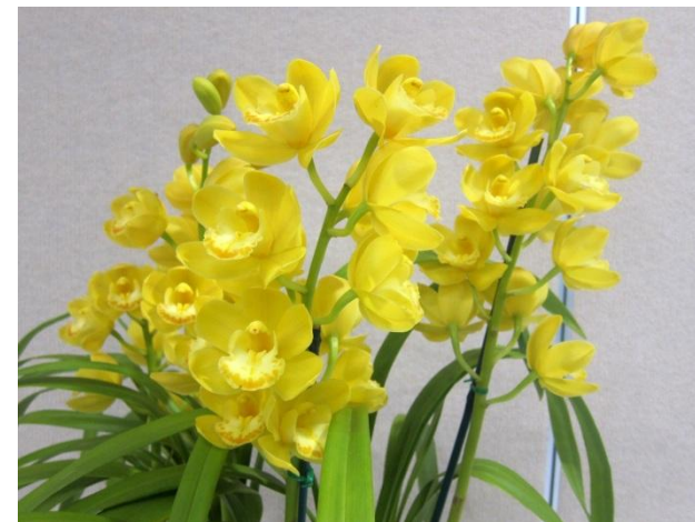
Cym Pharaoh's Dream Top class for early season;