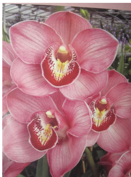
Seedling from Pepper Blaze 'Flame'