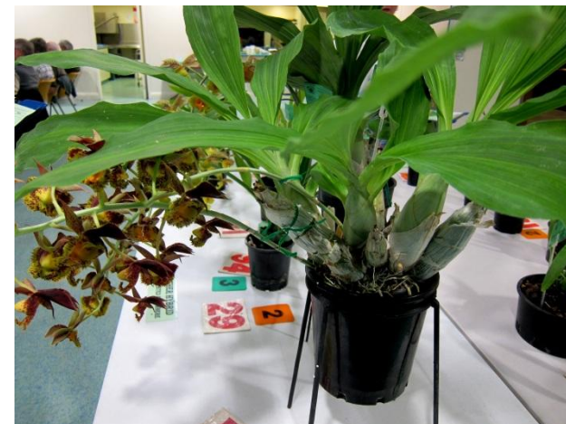
Catasetum Lovena B the largest plant with the most distinctive blooms from the Wilsons. They tabled three plants, (all distinct), of this cross.