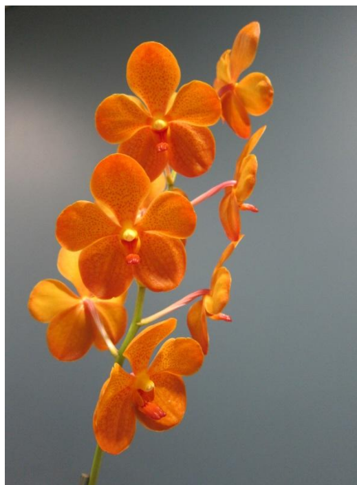
Mokara Chao Praya 'Sunset'.