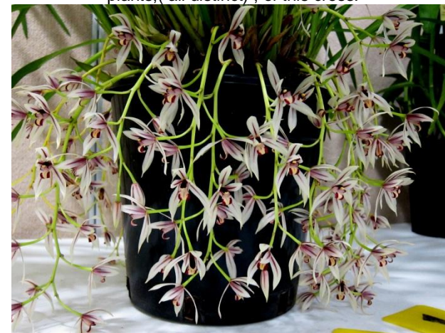
Sarka Laznicka's large floriferous plant of Cym dayanum Heat tolerant with lovely clean foliage, too, and always flowers at this time of year.