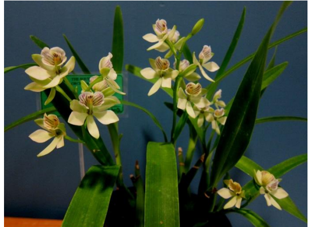
Prosthechea radiata is an attractive, shapely orchid not difficult to grow if you can get a piece.

One of my favourite plants tabled last month, Rothara Jungle Jumbalaya. It displays its bright blooms particularly well.