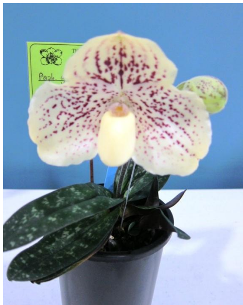
Paph godefroyae 'Vincent Vista'-HCC Best seedling.