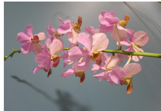
Vanda Crownfox Diva x Miss Joaquim