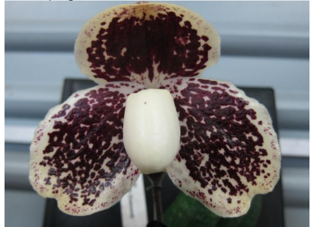
Paph godefroyae 'Black Knight' HCC