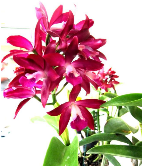
Ctt Valentine's Day

We can always tell when Autumn is around the corner when we see the bright and showy cluster type Ctt Valentine Day in all its purple/pink and maroon shades making their appearance. Most varieties are eyecatchers, and it's usually the culture of the plants which determines the biggest and best flower head— always easy to grow and flower , and they don't need a heated glasshouse to produce really nice blooms.