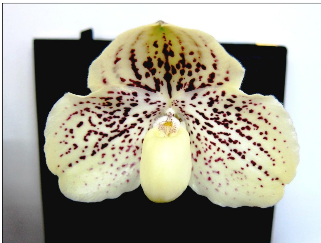
Paph godefroyae var leucochilum 'Vincent Vista'.