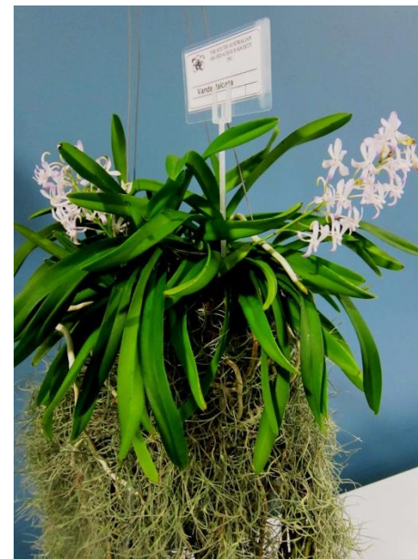
Vanda (Neofinetia) falcata .