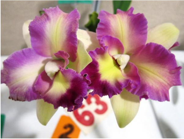
Rlc Varut Roongkamal

Always showy, and with eye catching colours, the hardest thing about growing these catleyas. Is writing out the labels.