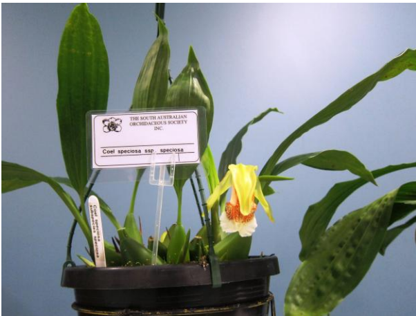
Coelogyne speciosa ssp speciosa.

Always showy, and with eye catching colours, the hardest thing about growing these catleyas. Is writing out the labels.