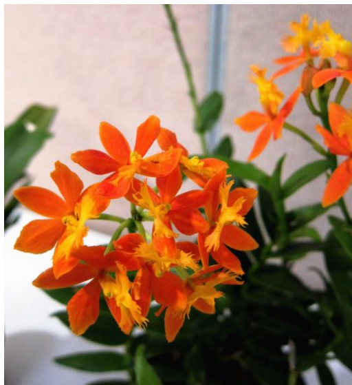
Sarka Laznicka's epidendrum