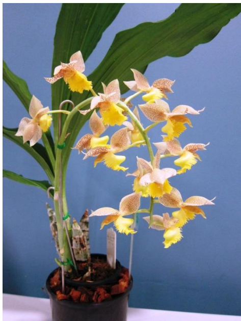
Catasetum tigrinum x fimbriatum