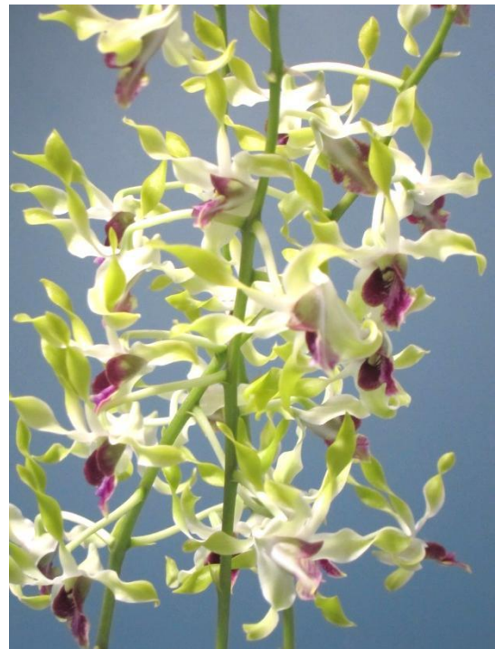
Den Spiral Gem x Uniwai 'Topaz'

Fred Cawse brought in two nice tall tropical plants, a hard-cane Dendrobium and an Aranda .