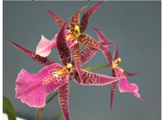
Wide flat segments and good colour make this an attractive orchid to grow.

Miltassia Aztec 'Toni' is now being produced by a number of members. It features ease of growing, reliable flowering once maturity is achieved, good colour and form. It appears to be somewhat down on flower count on the spikes when compared with the old favourite Miltassia Estrelita , but it is still a rewarding miltassia to grow.