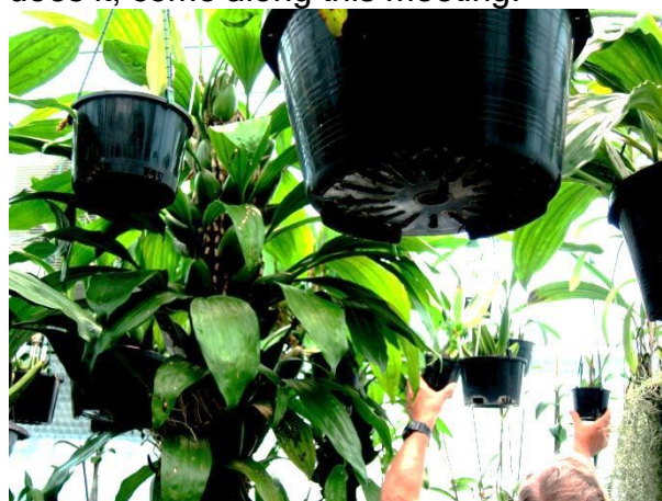
Preparing for a dose of 'jungle juice'