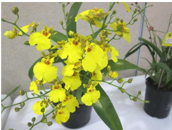
Gomesa Sweet Sugar .

Lovely golden concolour blooms of heavy texture Barb. Semmens could be considered unlucky, as her lovely bright yellow 'dancing lady' type Gomesa Sweet Sugar had a lovely spray of golden blooms, but there were just not enough out to feature as Best of Division All flowers and buds were on just one sturdy branching spike, as a result of good culture