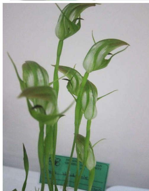
Diuris Earwig & Ptst Hoodwink