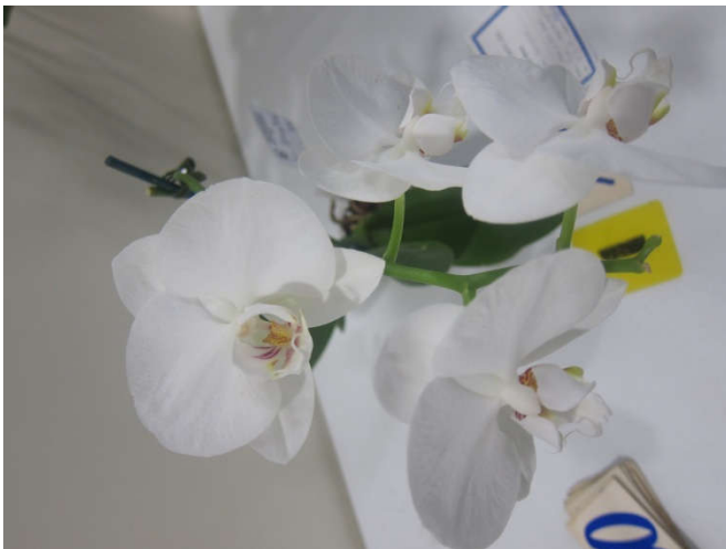
Phal. Springtime from the Steers.