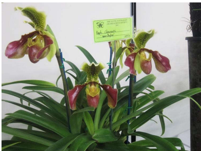
Paph Chouvetii van Dyke.

Confusion often occurs between the more common Max. porphyrostele , and Max picta , and Max chrysantha , They all soon grows into specimen plants