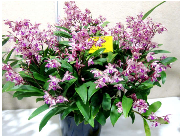
Den Victorian Flare x Victorian Stripe