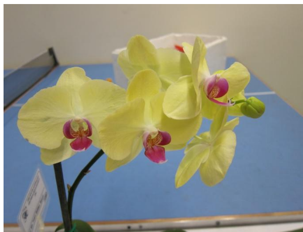
Phal Sin Yuan Golden Beauty