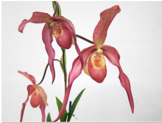
Phragmipedium Ruby Slippers