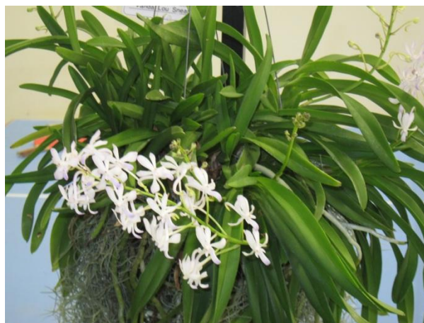
Vanda Lou Sneary

A miniature hybrid from what was formerly known as Neofinetia falcata .