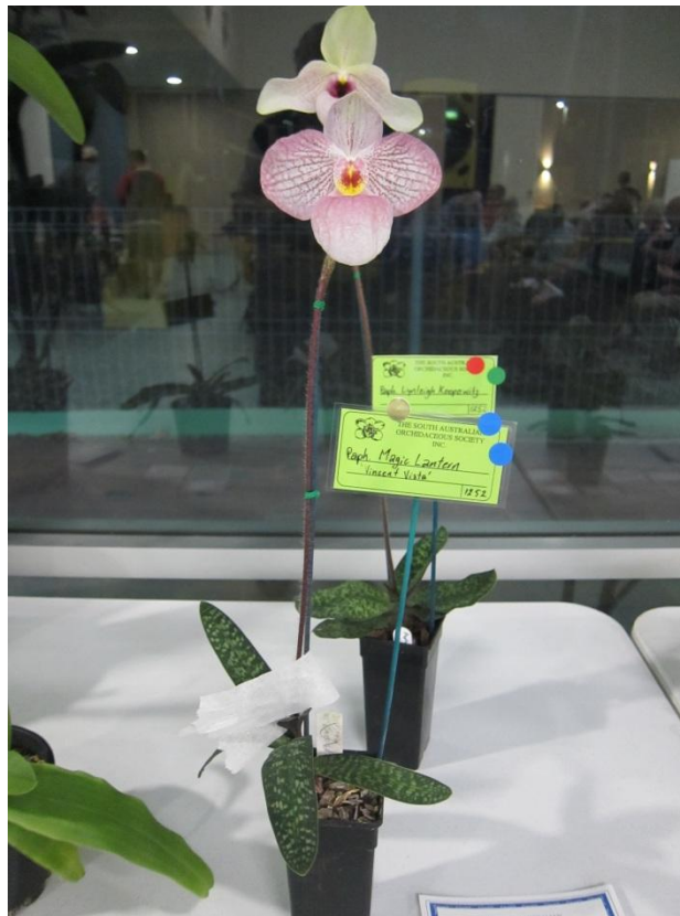
Paph Magic Lantern 'Vincent Vista'