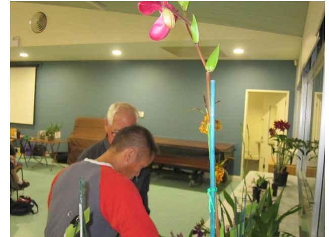
So tall I had to stand tippy toe to get it in the photo.