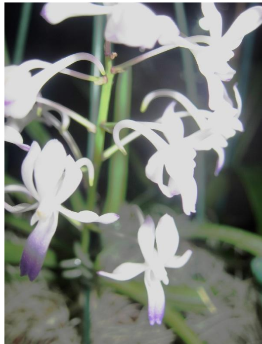
Vandachostylis Lou Sneary