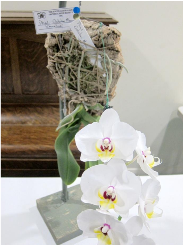
Phal October Moon 'Christine'

'Not to be outdone by her husband, Ann Steer shows she can grow orchids just as well as her husband, and mounted on a block, too. Well done, Anne. .Not so easy to transport to meetings when grown like this, it was beautifully displayed on it's own stand.