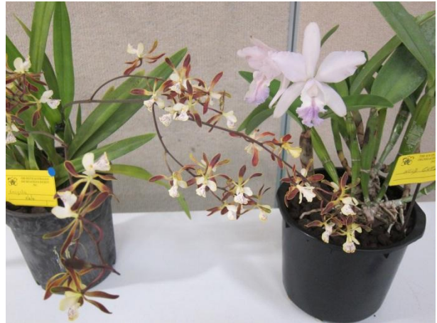
Encyclia alata on the left, Cattleya Unknown on the right