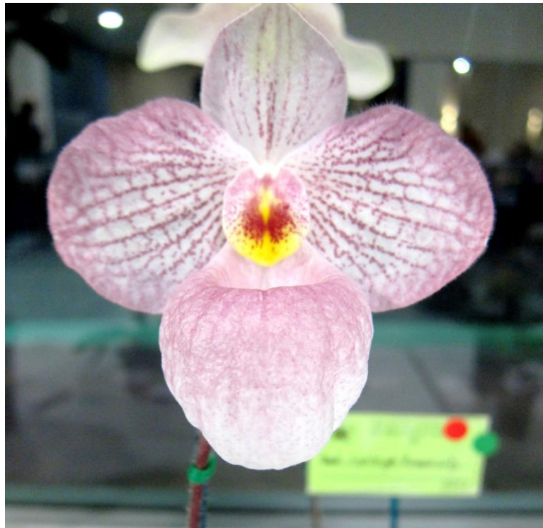
Paphiopedilum Magic Lantern.

March... meeting is the Third Wednesday of the month at the Adelaide West Uniting Church hall. 312 Sir Donald Bradman Drive Brooklyn Park. Hall opens 7pm for 8pm start