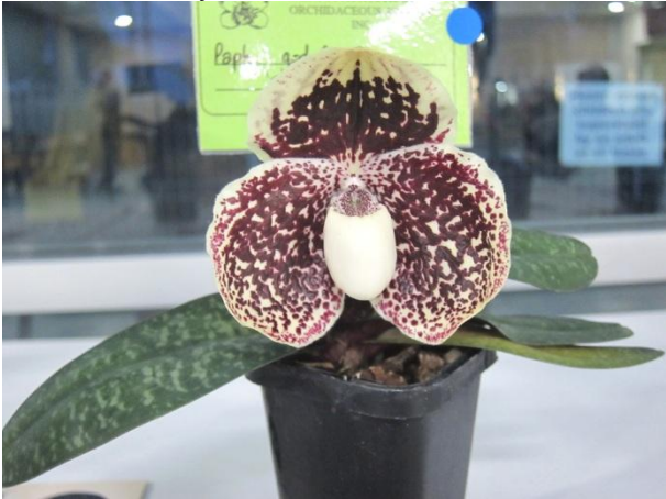
This is Paph godefroyae 'Super Dark' growing beautifully in a tiny pot.'

others to see. As well as the seedling shown on the cover, we saw repeat flowerings of the species paphs they showed last year.