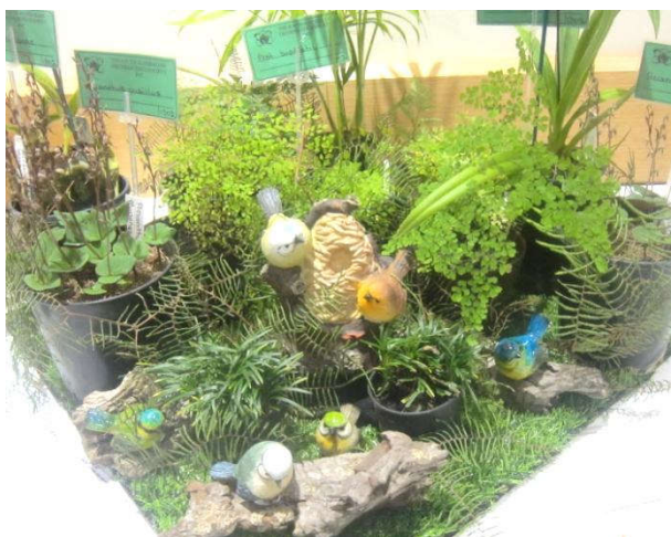
Orchids are important, but so are balance and finish.

Why not plan to enter a mini tabletop display? You don't need a lot of orchids, as you will have observed at our previous Klemzig Community Hall shows.