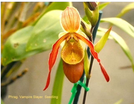
Phrag Vampire Slayer

The first this month is a seedling phragmipedium from the Higgs's which flowered last month, but which I received too late for inclusion then.