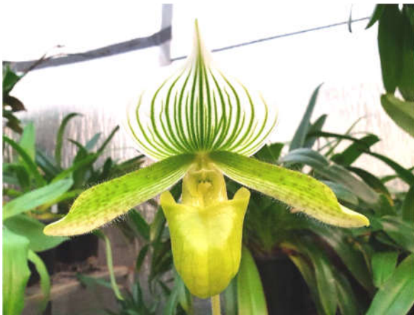
Paph Hilo Super Green x Hsinying Bonjour