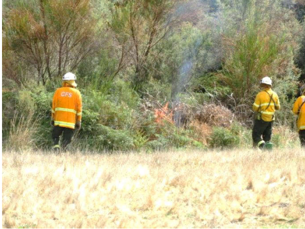
There she goes.

Once the wind direction had been ascertained, the fire was started around 2 edges of the swamp opposite to the wind direction. This fire was made to burn for about 2 metres in before the main fires were lit to burn with the wind.