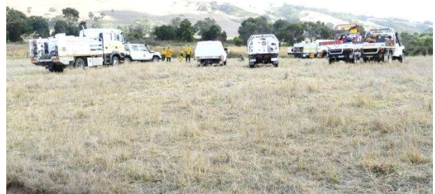
The cavalry arrives.

there were 5 large fire engines and several smaller vehicles involved with rangers and CFS workers overseeing.