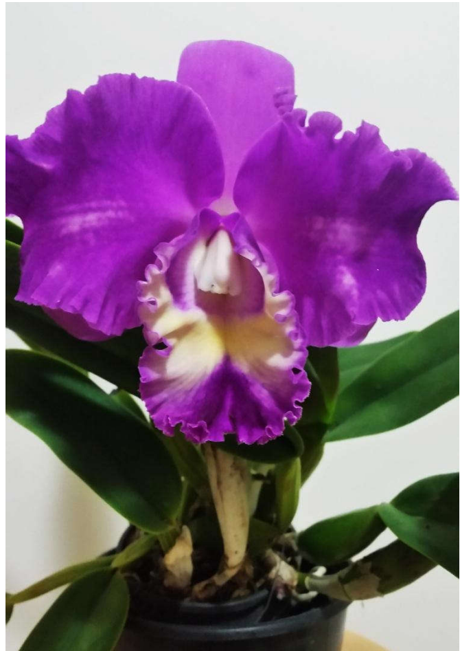
R/c Burdekin Spice.