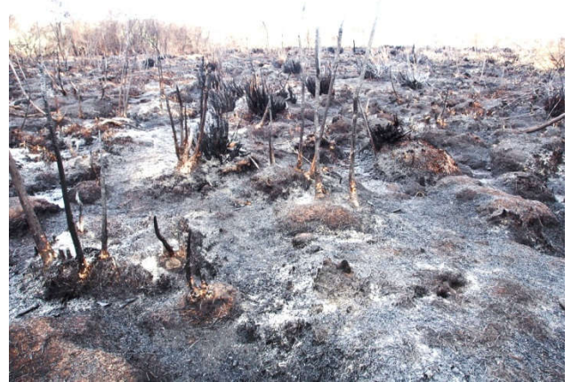
After the burn

As the swamp is made up of peat, when the fire was spent, great care was taken to put out any residual fires because peat can burn for days and also burn underground. The whole operation took nearly all day with a night team with thermal imaging cameras to check for hot spots remaining on sight till 10pm. The rangers continued to come back and check the area for several days afterwards. Luckily we had over 30 mm of rain a few days later which would have quelled any fire still lurking.