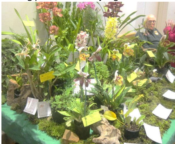
A well presented table top display

Some finesse will be enjoyed by the visiting public and the judges.