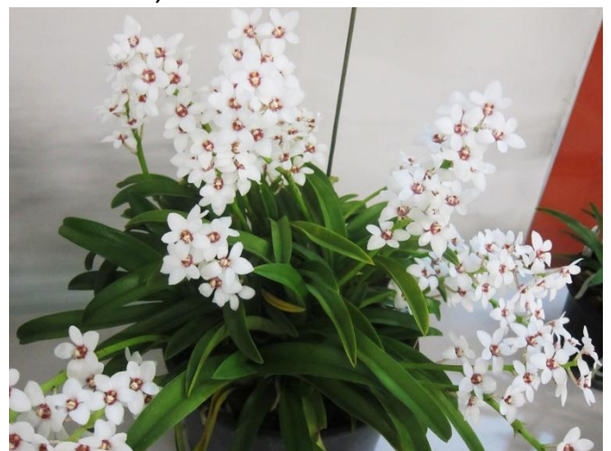
Best specimen sarco. shown by Lesley & Bob Gunn.

A large, multiple growth plant with long, pendulous racemes with many, fully open flowers in good condition and blooms nicely arranged on the stems.