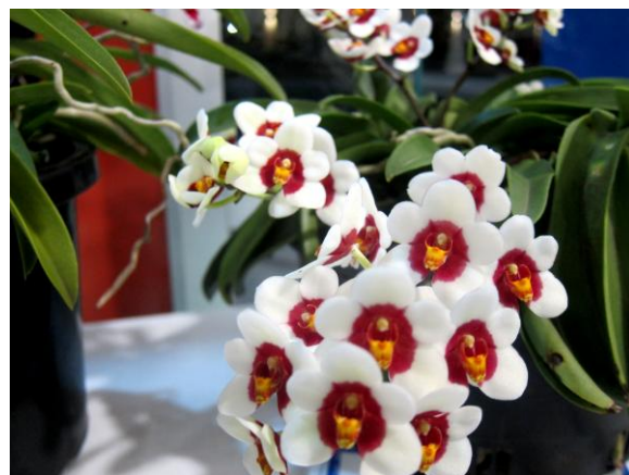
My pick for contrasting colours, size, and quality of the blooms. On a reasonably small plant, too, from my recollection.