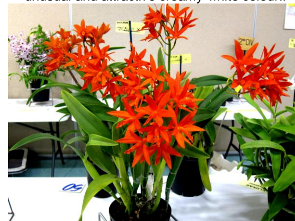
Joe Cassar's C Trick or Treat` Orange Beauty' is very aptly named

There were many other plants last meeting which deserved to have their photos included. Perhaps one night I could collect some of these together and show them on the large screen. They deserve it!