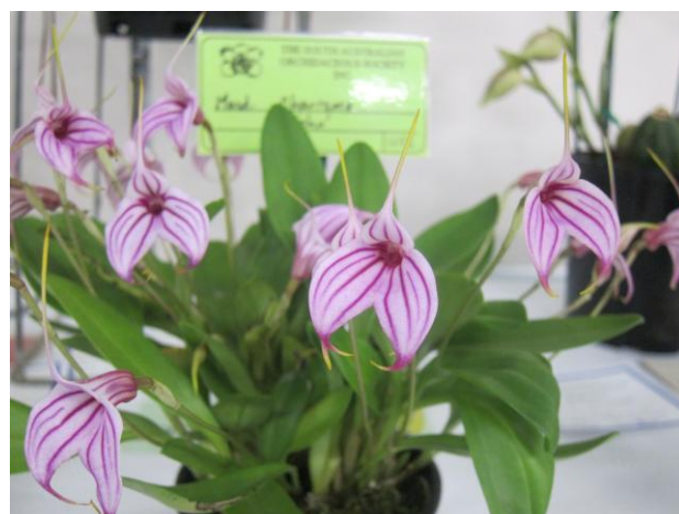
A very pretty flowering. Masdevallias are not easy to grow unless you can keep the plants cool