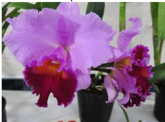
Cattleya Bonanza Queen , classic full form.

I guess the cattleyas were the eyecatchers in Open Div, with lovely lavender shades and rounded, full form and with wide lips.