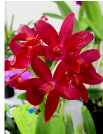
Ctt Zodiac Stardust