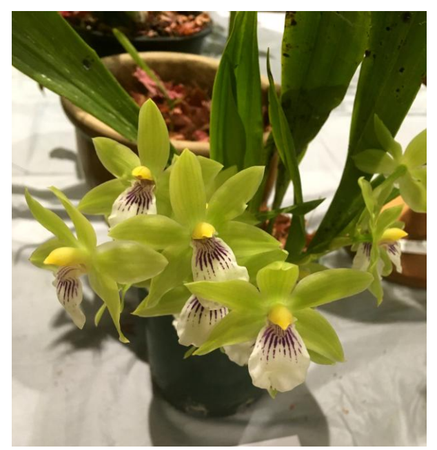
This mini zygo had three spikes, a good effort for such a small plant