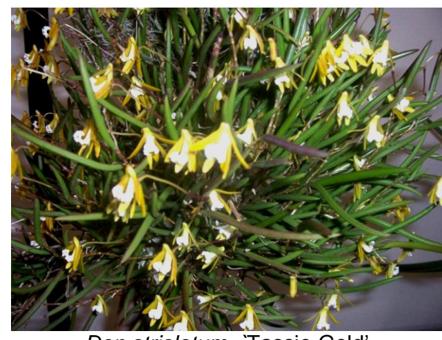
Den striolatum `Tassie Gold'