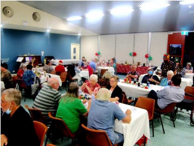
This group, part of the nearly 60 present, seem to be enjoying themselves.