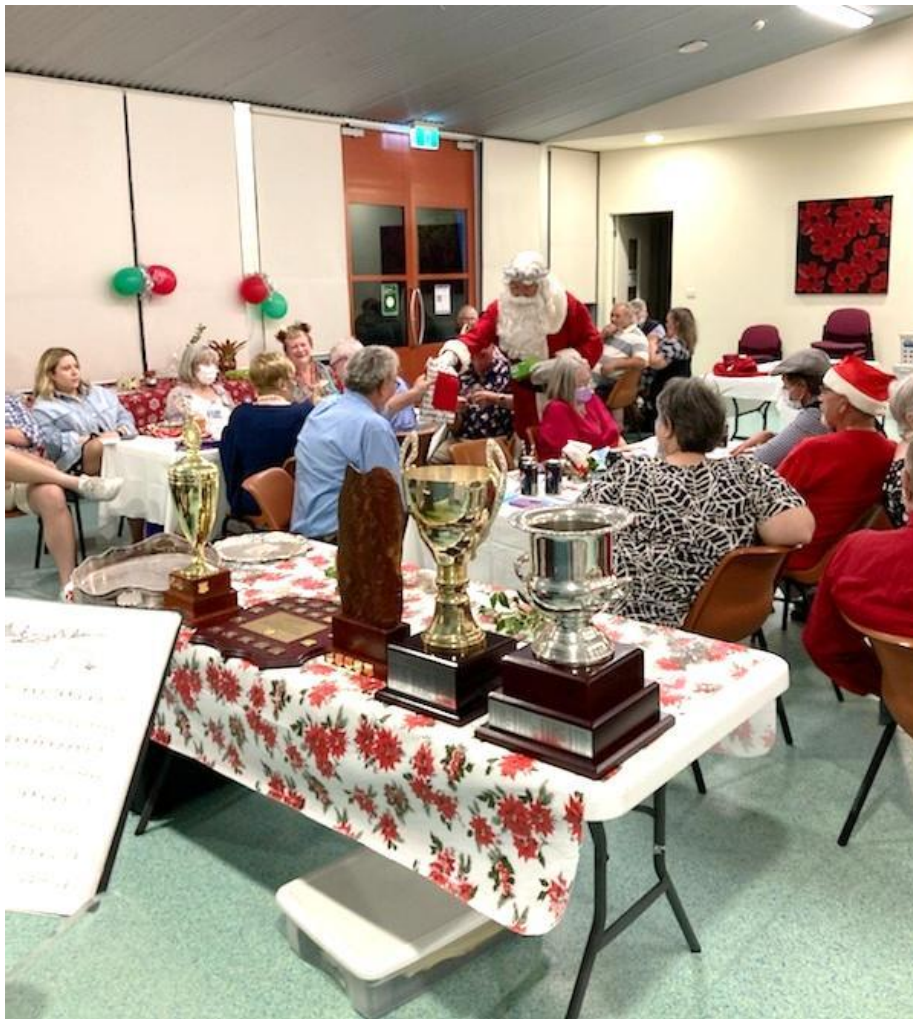
Christmas meeting 2021 Perpetual trophies on display.

NO MEETING JANUARY next meeting to be advised.