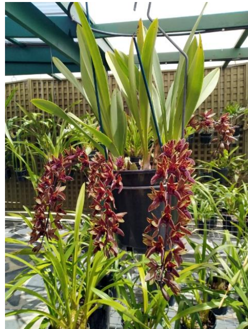
Cym Pied Piper

Vicky Cooper sent a trio of interesting plants.