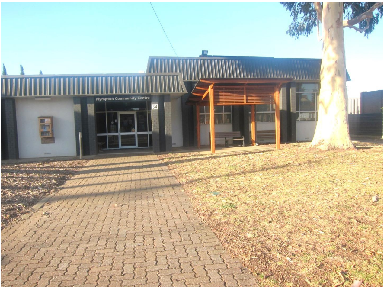
PLYMPTON COMMUNITY CENTRE LONG ST. PLYMPTON

Our new meeting hall at 34 LONG ST PLYMPTON . NOTE – ACCESS TO HALL NOT AVAILABLE UNTIL 7.30 pm Parking at side and at rear of hall.