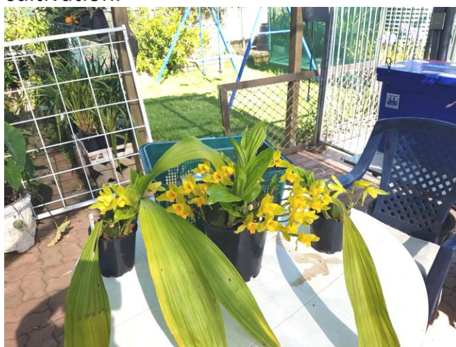
Lycaste aromatica , one of the perfumed South American species.

This next one from Ralph Edwards is a lycaste, a genus of intriguing orchids, both for their odd shaped blooms and their growing habit, which in many species, drop their leaves before flowering. Ralph has made somewhat of a study of these orchids and has a number of different varieties in cultivation.