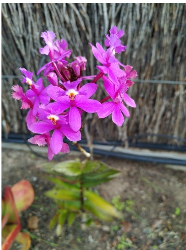
This very nice reed stem epidendrum is flowering beautifully on a small plant. Vicky intends to try growing them outside in the garden. She'll need to provide sun protection on those really hot days.