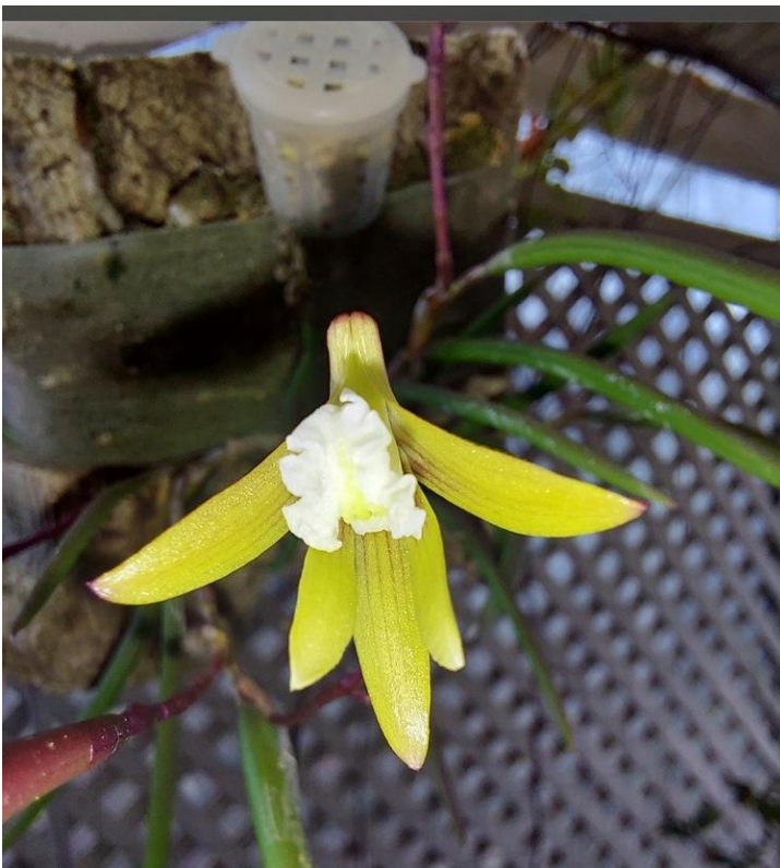
Dockrillia striolata ssp chrysantha

NOTE – Photos show Kevin’s little perforated plastic containers which are filled with slow release fertiliser, ensure a small dose of fertiliser every time he waters. Clever, eh!