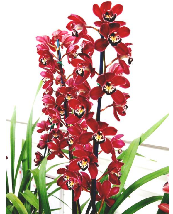
Cym Marilyn Levy `Wedding Buttons'