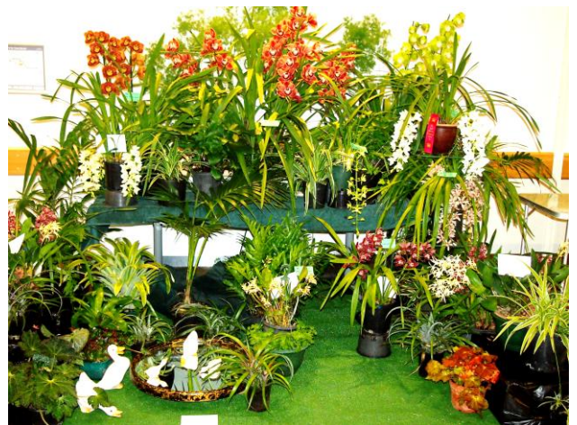
Floor display – individual exhibitor.

Displays & individual plants at the Show will be featured next month.