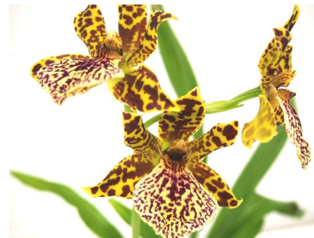
Pptm Kiwi `Zodiac'

The yellow colour in this zygopetalum hybrid comes from the mix of intergeneric genes.