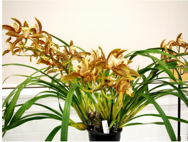
Cym tracyanum `Tambourine'