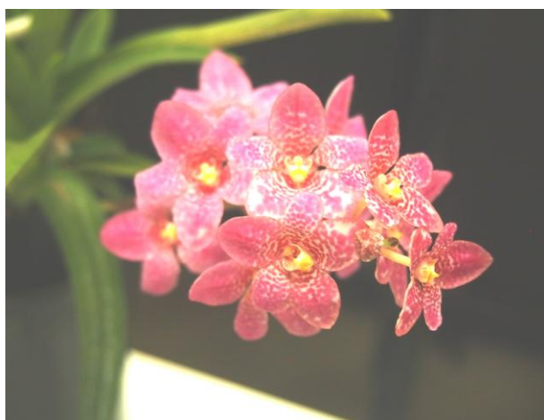
Champion sarcochilus of Show.

There were no sarcochilus in either of First or Second Divisions, for the first time ever, which emphasised the lateness of the season this year, as I know there were plants in spike from exhibitors in these Divisions. Let's hope there's more for the judges to adjudicate next year, or perhaps we'll have to consider deferring the special sarco. night to the November meeting.