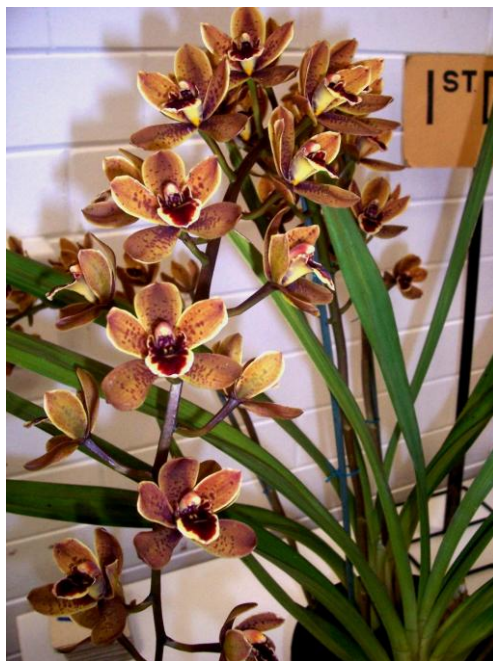
Cym Mad Magic. Cym Mad Magic `Amber` has the Aust species Cym madidum in its