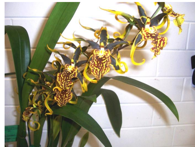
Bcd Gilded Tower `Mystic Maze`

parentage, making it a valuable late bloomer..