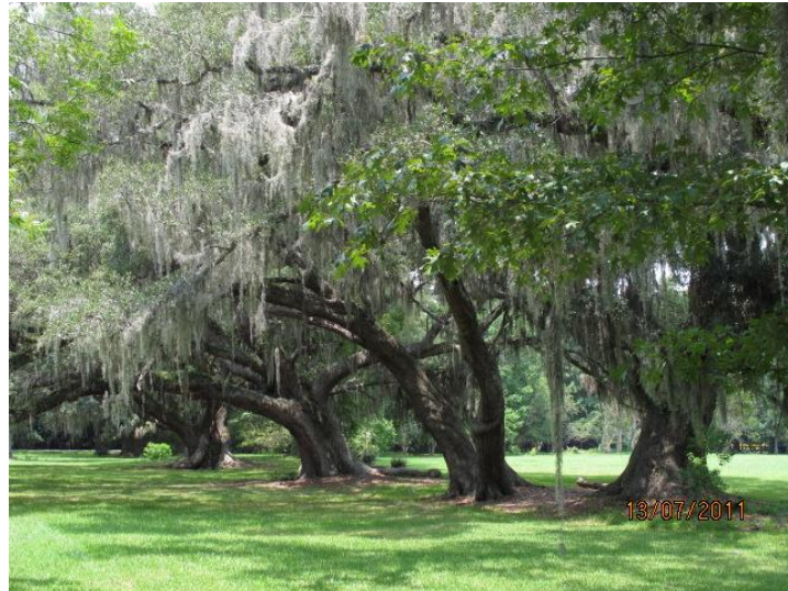
Spanish moss adorning the trees in South Carolina.

Spanish Moss, a member of the pineapple (Bromeliad) family is a common sight in the Southern United States. It grows in large beardlike masses up to twenty five feet long. Although it has aerial roots and is supported by other plants, it is not a parasite. It can cause a problem as the weight of it can break the tree branches. It is sometimes used as a filler in packing boxes and as upholstery.