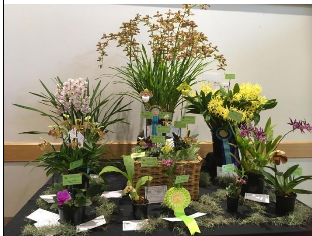
Floor display – individual exhibitor. M Willoughby & Oui Ju.