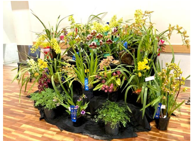
Composite floor display. Note our best display of standard shape slipper orchids for a number of years.

and no football. Thank you to all of our members who contributed to the organisation of the weekend.