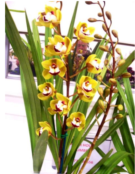
Cym Thumbs Up `Tamara'