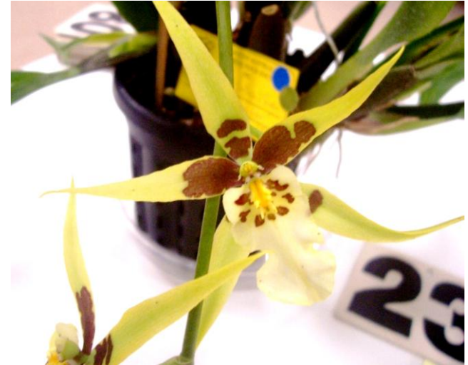
Vanda's Brsdm Yellow Star