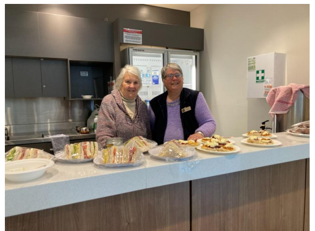
Waiting for the customers!