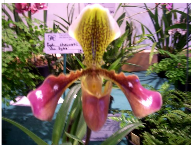
CRAIG GURNEY MEMORIAL Trophy.