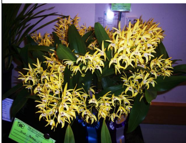
Den Issy's Snow `Seaview` Grand Champion.