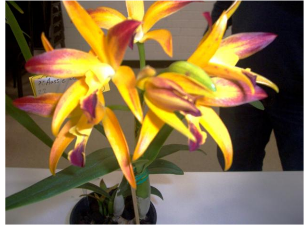
Ctt Adelaide Ablaze.