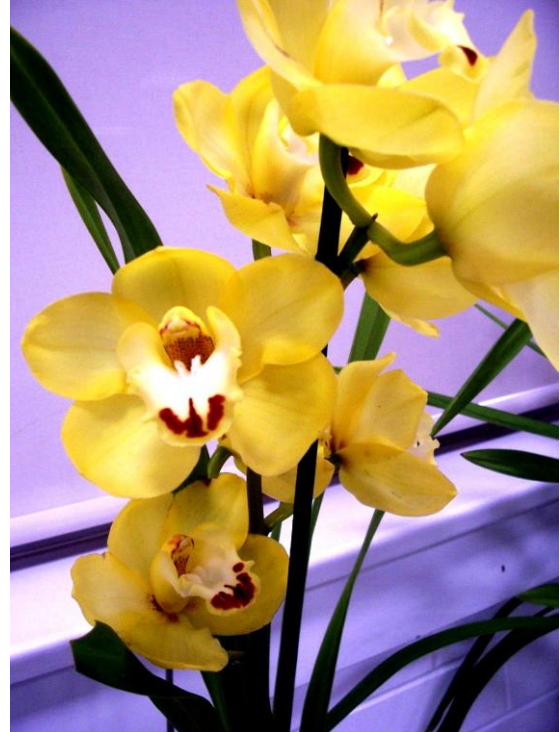
The large-flowered Cym Tracy's Bullion

The dramatically different shaped blooms of lycastes are not difficult to grow, but do not appear regularly in commercial growers options..