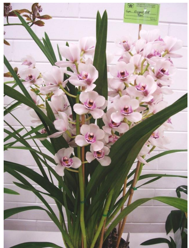
Cym Elegant Elf `Nan`