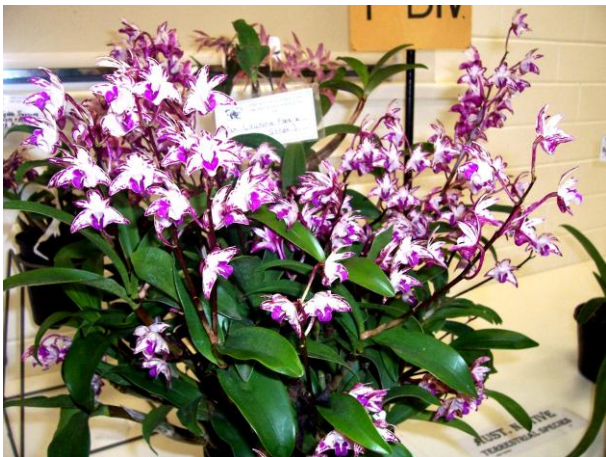
Den Victorian Flare X Victorian Stripe