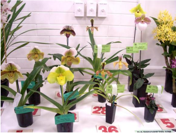
Open Div . paphiopedilums.

this year, and last month was no exception.