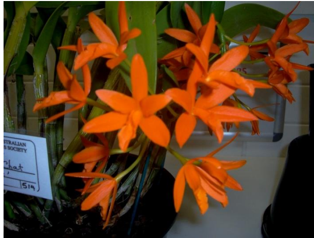
Ctt Chit Chat `Tangerine`