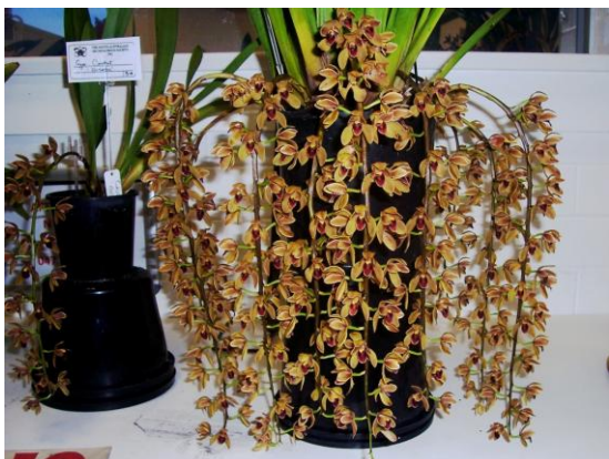
Cym Cricket `Rosetta` from A & P Steer.

Late cymbidiums tabled in the last couple of months in the year are usually the small flowered varieties, among which the Australian species feature prominently in the breeding, Impressive flowering results can be obtained. .