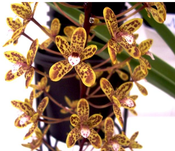
Cym canaliculatum `Jock's Comet`