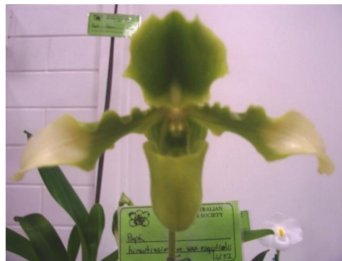
Paph hirsutissimum var alba.