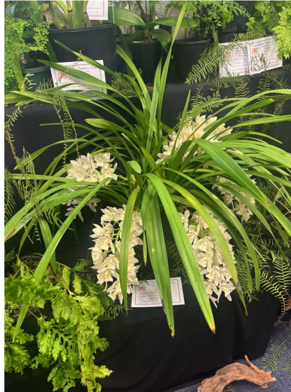
+ Cym Sarah Jean 'Ice Cascade'

Cym Cym Sarah Jean 'Ice Cascade' T & M Jacob