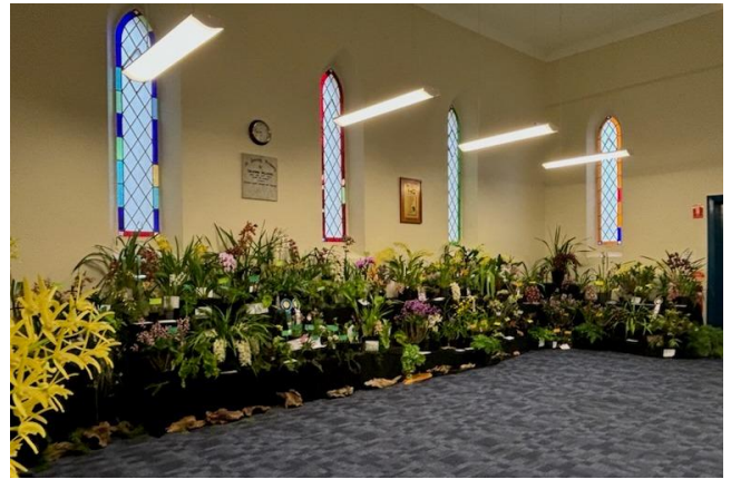
Spring Show main display – a combined display from all Divisions.