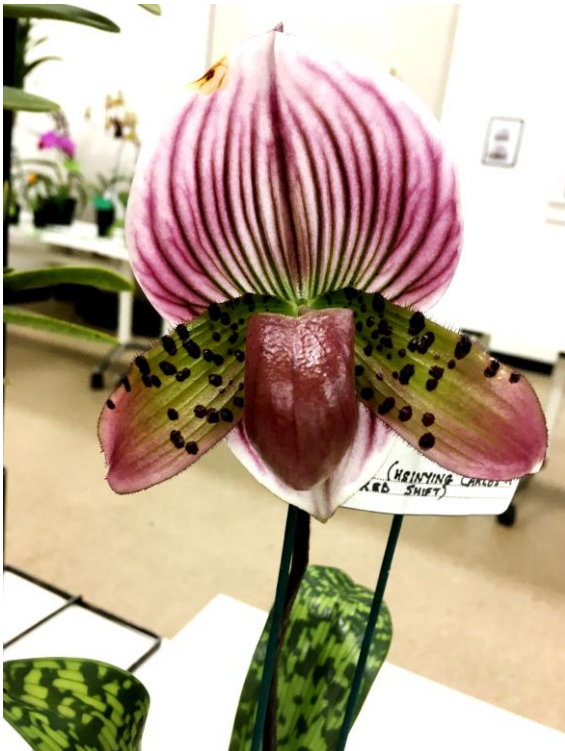
Paph Hsinying Carlos x Red Shift.

consider it for a First place – let's see next season..