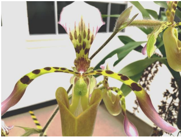
Four big blooms on a dramatic stem.