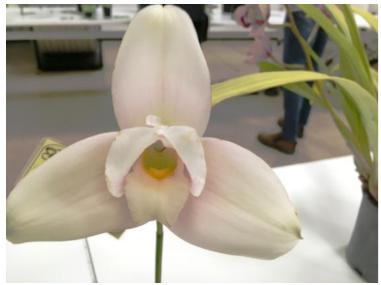
Lyc Macama 'Aline'

Next we have the eyecatching dendrobium species, Den lindleyi , from India. It needs a dry rest during Winter, so should grow well here.