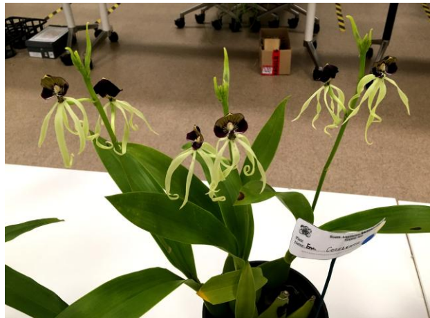
Joe's attractive , easy to bloom prosthechea.