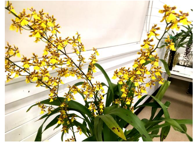
Ralph Edwards' well grown oncidium.